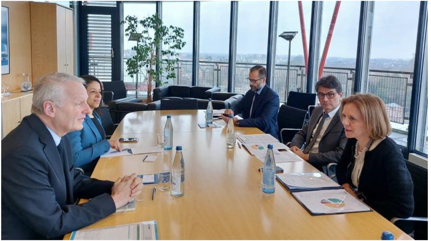
Discussion with French jurists from the ECHR registry